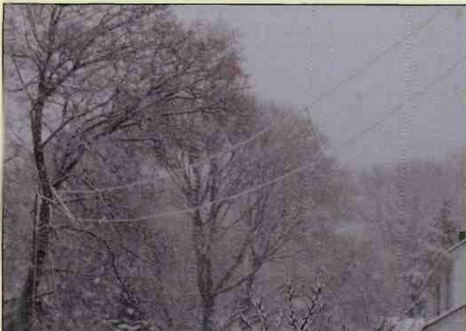
Mother Nature dished out the goods this past winter (and Spring!) and the B&W Folded Dipole didn't fold under the pressure.