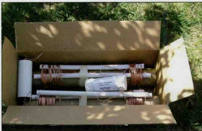
Five minutes after it arrived I cut open the B&W box. That's all there is—nothing fancy or complicated.

The B&W 1.8–30 Folded Dipole comes fully assembled. The sturdy, clear plastic mounting hardware is all pre-drilled and ready to use. All you have to do is carefully plan your installation, as you would for any antenna, lay it out in the yard and