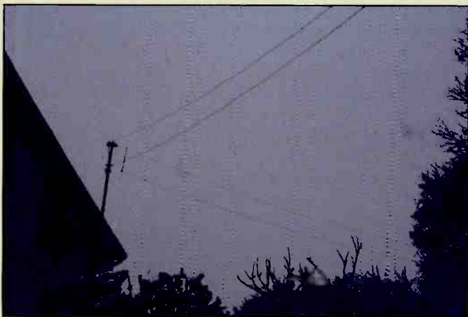
The shack end of the installation. The coax runs perpendicular to the antenna down the wooden pole and into the window to the right of the air conditioner.

mined by tradeoffs of height, available supports, and interfering objects. Sometimes multiple trials may be necessary to judge which installation is best." That was certainly true for me. My ham transceiver, a new Ten-Tec Jupiter, was suffering from RF feedback; really the fault was mine for initially mounting the antenna too close to the shack, and once I changed the location it worked fine.