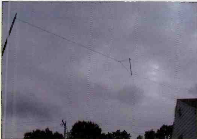
One leg of the antenna bolted to a 20-foot pole; the other is attached to a similar pole on the back of a shed.