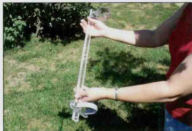
The antenna's balun and balancing network fasten to this part of the Barker & Williamson mounting kit.

Take a look at the photo of the antenna and you'll see why taking the time to carefully unpack and unroll the ends is so important. I'd advise you to already have your mounting location chosen. Ideally it should be at least 25 feet high (or 12 feet for an inverted V or sloper) and 40 feet high for operation at low frequencies. Remember, height is most important. The well-written B&W instructions say, "The location will usually be deter-