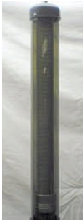
Model 100A-HP -- 3.5 MHz with 5 ft. whip @ 18" of coil showing