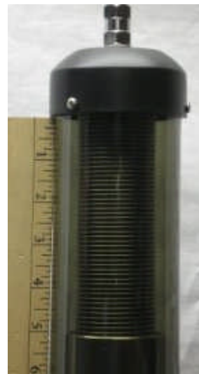
Model 100A-HP -- 7.1 MHz with 5 ft. whip @ 5" of coil showing