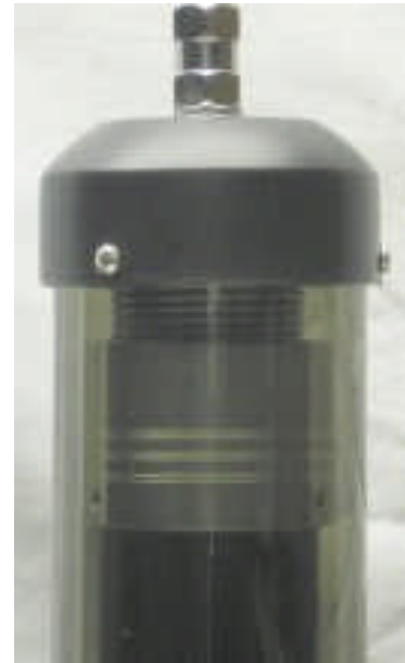
Model 100A-HP -- 21.2 MHz with 5 ft. whip @ 1/2" of coil showing