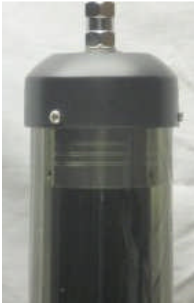
Model 100A-HP -- full down position with 5 ft. whip -- 29.0 MHz

The following photos will show you relative tuning positions of the Model 100A-HP Tarheel Antennas.