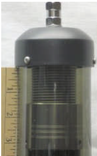
Model 100A-HP --14.2 MHz with 5 ft. whip @ 1 1/2" of coil showing