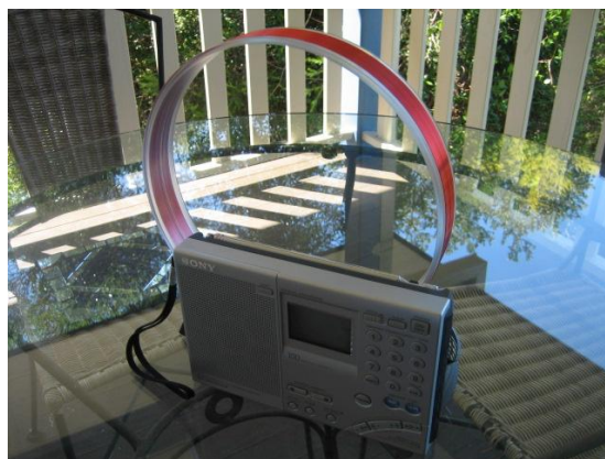
Photo to demonstrate the size of the loop in comparison to the portable Sony

Tuning across the band in between the stations and peaking the "loop tuning control" peaked the reception across the band.