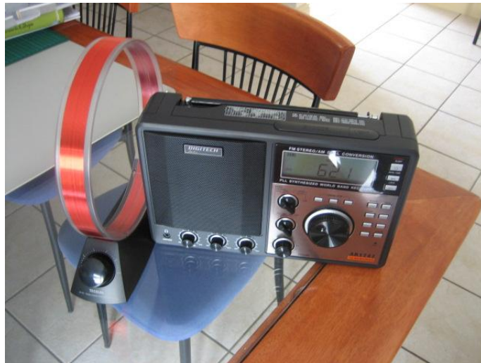
Jaycar AR-1747 AM/FM Shortwave radio with the Loop in action

By far the best performance was with the loop as shown in the photo below.