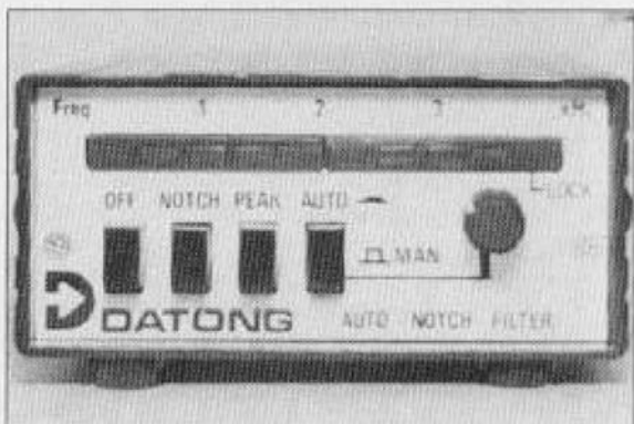
Photo C. The ANF is the best "black box" I have seen in a very long time. I strongly recommend it.