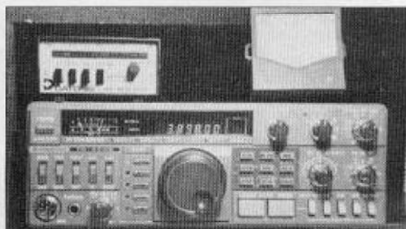
Photo B. Notice the 10 segment LED bar graph at the top of the ANF for displaying search and lock action.