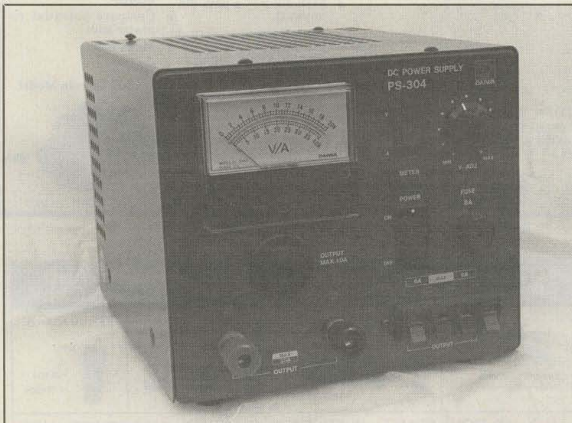
Front view of the Daiwa PS-304 power supply. At the upper left is the meter and immediately below is the cigarette-plug receptacle. The high-output terminals are at the lower right.