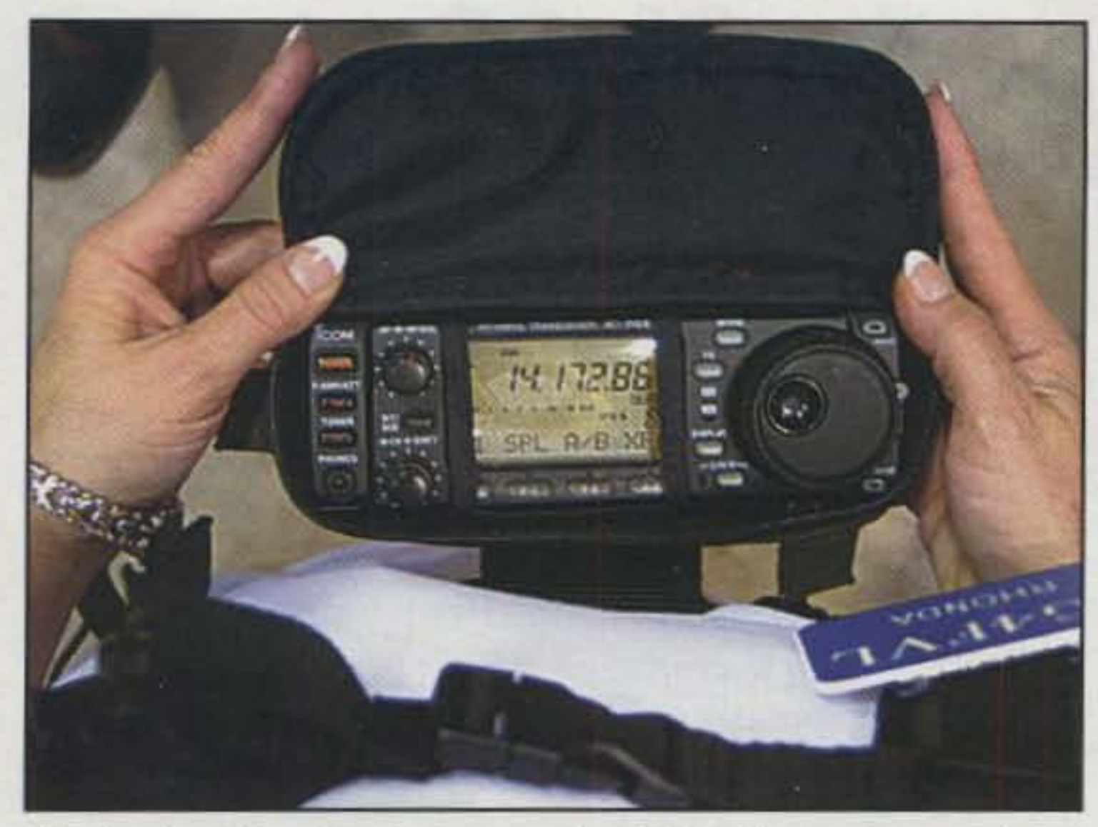
Photo 4— Rhonda shows us the IC-703's front panel/controller, which is carried in its belt clip pouch and connected to the transceiver's main body by an optional OPC-581 controller/rig separation cable.

rear heatsink. The rig and an optional 9.6 volt 2800 maH BP 228 battery pack can thus be stuffed into a carrying bag or backpack for on-the-spot operation anytime and anywhere. Realizing that fact, ICOM also developed the LC-156 "multi pack" for the IC-703. In addition to holding the IC-703 and BP-228 safe and sound, the backpack has mounting loops to hold a whip antenna, a removable belt pouch for the front panel/controller, and extra pockets for the microphone and maybe a key. An optional ICOM OPC-581 cable is used/required when the front panel is separated from the main body.