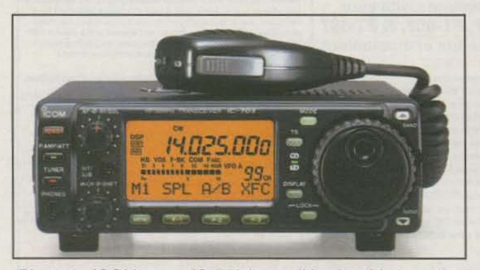
Photo 1– ICOM's new IC-703 is small in size, big in performance and a QRPer's dream. It looks like an IC-706, but it is lighter in weight and specially designed for portable operation with a built-in automatic antenna tuner, DSP, and battery-efficient circuitry.

*4941 Scenic View Drive, Birmingham, AL 35210 e-mail: <k4twj@cq-amateur-radio.com>