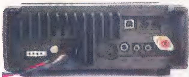
Photo 2: A view of the rear panel of the IC-7200 with the PSU cable plugged in. The connection to the external ATU is to the left of the power plug; the USBB connector is to the left of the Remote and External Speaker jacks.

The IC-7200 uses a high stability TXCO (+/- 0.5 ppm), and twin A and B VFOs are selectable with the A/B button. Multiple band-stacking for each band, a feature of other Icom radios, is not available. Single band-stacking is used, however, which means that each time you return to a band,