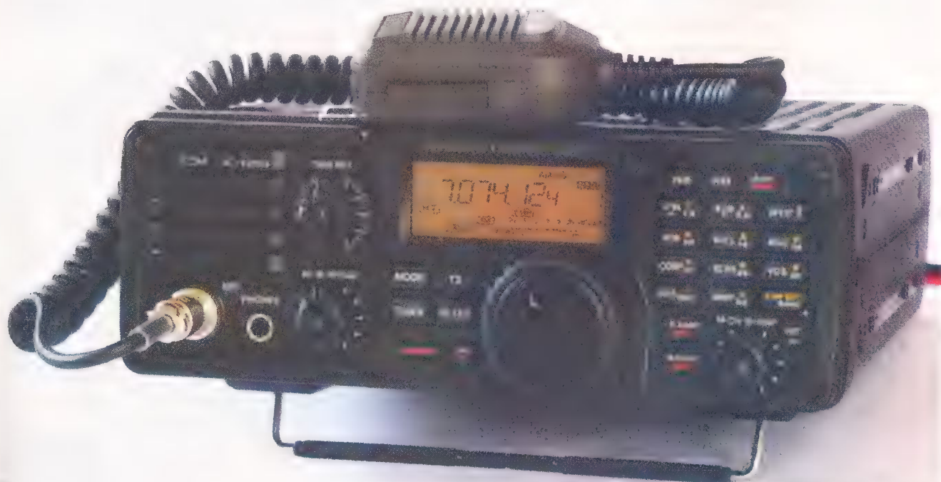
Photo 1: A front panel view of the IC-7200 propped up on the supplied bail. The HM-36 hand microphone that comes with the radio gives an indication of the compact size of the transceiver.