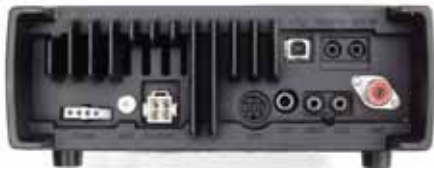
The USB port is a most welcome addition to the usual array of rear panel connectivity.