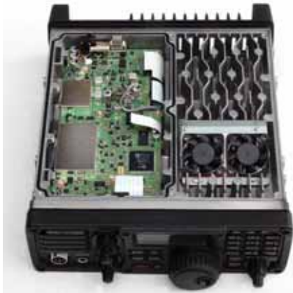
Opening the top cover reveals the main PCB and substantial fan-blown heatsink.

rather poor at little over 60dB. Rejection of the second IF image at 910kHz above the on-tune frequency was around 90dB. Other spurious responses, which can be a problem with DDS synthesisers, were generally at a low level of around -90dB or better, which is quite a good result. The AGC performance was generally clean and with no 'attack hole' as seen on some DSP based radios.