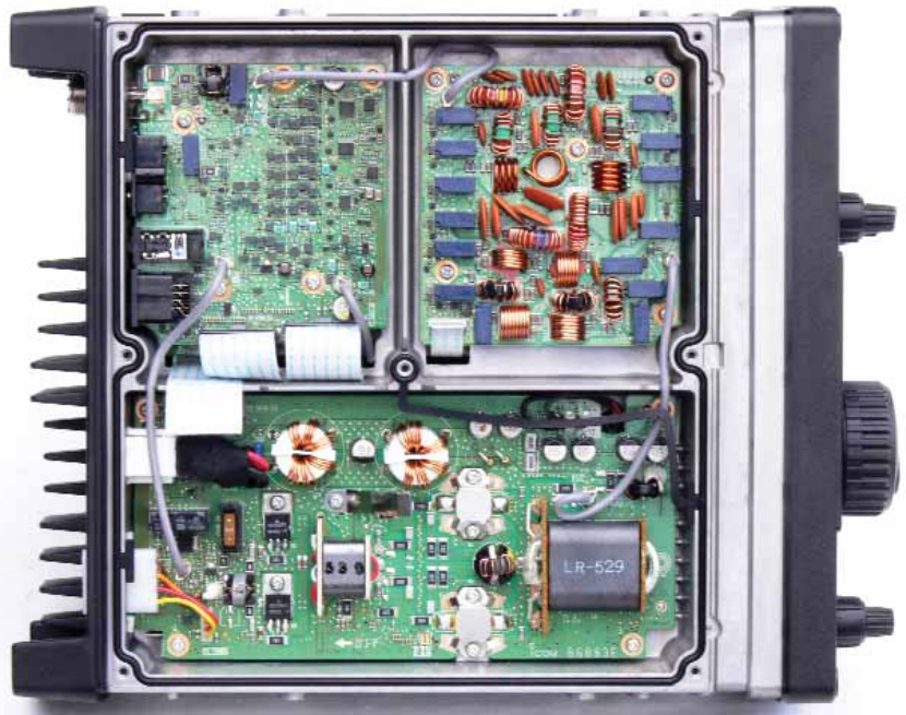
Underneath the bottom cover are the PA board, output low pass filters and front end filters.

On transmit, distortion products on SSB were fairly good for a 12V operated power amplifier, except on 24MHz. A VOGAD circuit is incorporated into the transmit audio. This is a long time constant AGC, making level setting less critical and preventing gross distortion from overdrive. The processor