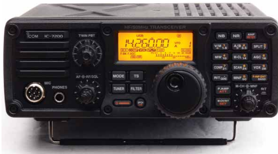
The Icom IC-7200 is a rugged-looking radio that should give years of dependable service.

NEW KID ON THE BLOCK. The IC-7200 is the latest radio from Icom. First seen in the UK at the recent RSGB HF Convention, it is billed as an entry-class transceiver but it is certainly not short on essential features. As a midi-sized radio with rugged looks and rugged construction, it is equally suited to outdoor use and travel as well as normal operation from home. Although not waterproof, it has a measure of protection against the weather using techniques that Icom has developed for their range of marine radios.