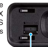
microSD card slot

* A microSD card is required separately.