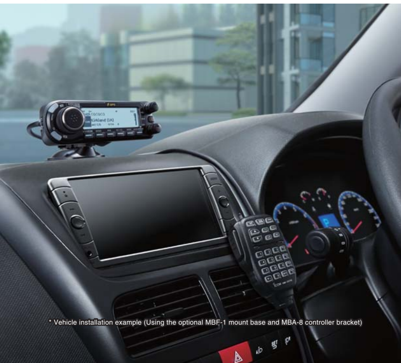
* Vehicle installation example (Using the optional MBF-1 mount base and MBA-8 controller bracket)

The controller can be attached or detached from the main unit for flexible installation. By using the supplied OPC-837 controller cable, you can install the controller up to 3.5 meters (11.5 ft) away from the main unit.