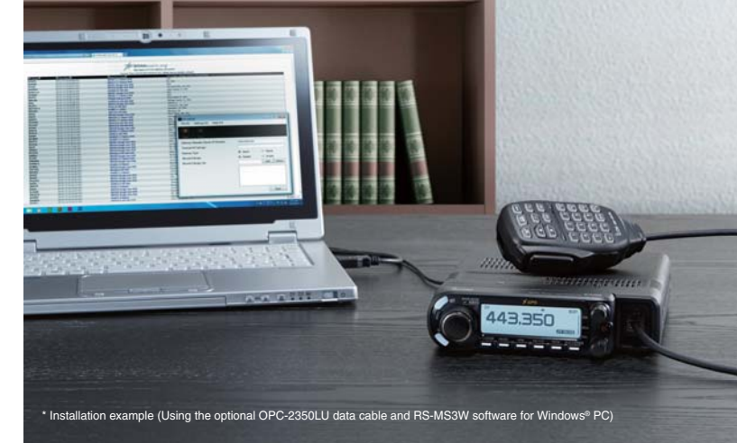
* Installation example (Using the optional OPC-2350LU data cable and RS-MS3W software for Windows® PC)

*1 Working range not guaranteed. *2 USA version only.