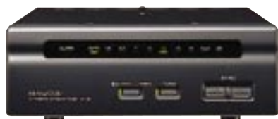
AT-50 Automatic antenna tuner

Useful for both mobile and fixed installations, this ensures good performance even at band edges. Accurate tuning is initiated simply by pressing the AT TUNE key on the TS-50S. And since band data is transferred to the tuner, there is no need to operate the AT-50 directly — it can be installed in a car's trunk. The AT-50 can also be used with other transceivers.