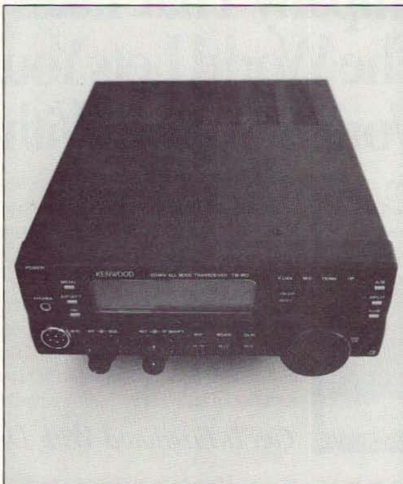
Photo A. The Kenwood TS-60S all-mode transceiver.