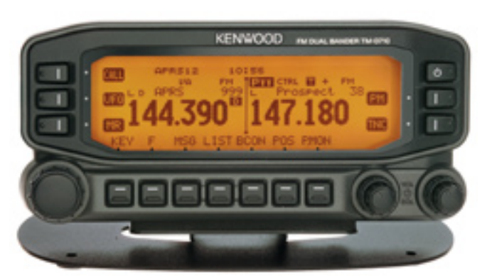
Figure 1 — Here, the TM-D710A's control head is set up for APRS operation on the left side and voice operation on the right.

clatter when within range of one another, indicating that we are close enough for simplex voice communication. There's now a settable menu option called Voice Alert on the 'D710A for this function.