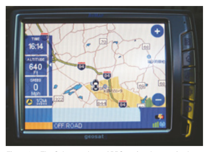
Figure 2 — The G5's map shows APRS station data received from the Kenwood TM-D710A near the center of the display. The blue area near the bottom of the screen is for location and driving directions when the vehicle is in motion.

for the personal navigation marketplace. It offers turn-by-turn driving directions and options such as fastest or shortest route. A line at the bottom of the display spells out your current location, and another tells you the street to take at the next maneuver. Next to that, a graphic depicts the maneuver