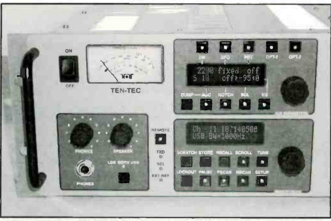
The left side of the receiver features the memory and operating sections, as well as the signal strength meter. Note the dual volume controls for speaker and headphones.

levels. In addition, there is a USB/LSB BOTH switch for the AUDIO portion of the signal as one last line of defense against an interfering signal that makes it all the way through. I did find a few occasions where this control was very useful.