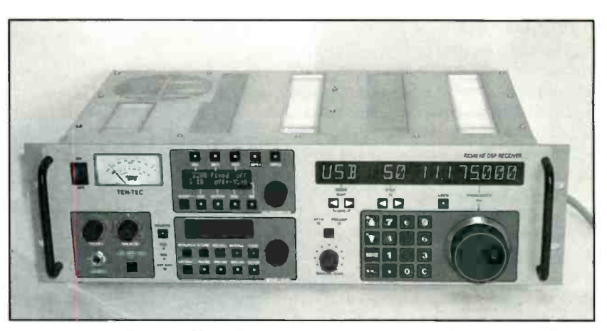
It's certainly an impressive receiver. You can almost picture about a dozen of them mounted in racks on some military base, but this state of the art receiver could be in your shack. You could mount a dozen of them too, but you'll need a very big checkbook!

One hundred memories are available for storage of frequencies and other settings so that the receiver is ready to go as soon as the memory is selected. Also available are one hundred frequency lockouts so that undesired frequencies can be skipped