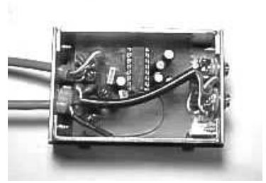
Internal view. Not pretty, but it works :-)

External view of homebrew interface with 4 connectors to rigs.