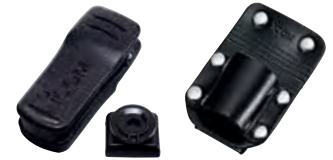
▲ MB-93 ▲ MB-96F

MB-93 : Swivel type belt clip. MB-94 : Alligator type. Same as supplied. MB-96N : Swivel type belt hanger. MB-96F : Fixed type belt hanger.