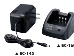
▲ BC-145 ▲ BC-160

BC-160 DESKTOP CHARGER + BC-145 AC ADAPTER Charges the BP-232N in 3 hours (approx.). BC-119N + AD-106 + BC-145 is also available. : Charges the BP-232N in 3 hours (approx.).