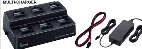
▲ BC-121N+AD-106 (6 pcs.) ▲ OPC-656 ▲ BC-157

BC-121N MULTI-CHARGER + AD-106 CHARGER ADAPTER + BC-157 AC ADAPTER (Six AD-106s are required) Charges up to 6 battery packs in 3 hours (approx.) when BP-232N is attached. OPC-656 DC POWER CABLE : For use with the BC-121N. (12–20V DC required).