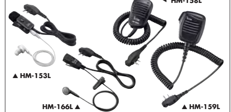
▲ HM-153L ▲ HM-166L ▲ HM-158L ▲ HM-159L

HM-153L : Durable earphone-microphone with revolving clip. HM-158L : Compact and durable body with plug screw connector. HM-159L : Full size durable speaker microphone. HM-166L : Light-weight earphone microphone with revolving clip. SP-13 : EARPHONE Provides clear audio in noisy environments.