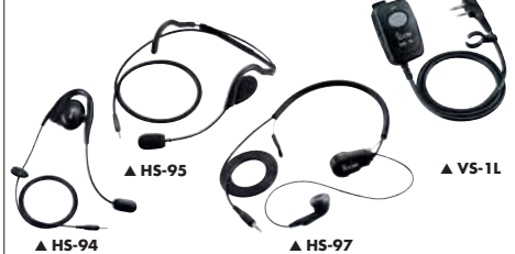
▲ HS-94 ▲ HS-95 ▲ HS-97 ▲ VS-1L

HS-94 : Earhook headset with flexible boom microphone. HS-95 : Behind-the-head headset with flexible boom microphone. HS-97 : Throat microphone fits around your neck and picks up speech vibration. VS-1L : PTT/VOX unit. Required when using these headsets with the transceiver.