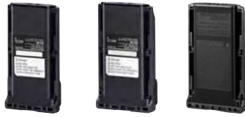
▲ BP-230N ▲ BP-232N ▲ BP-240