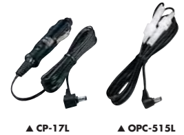
▲ CP-17L ▲ OPC-515L

CP-17L CIGARETTE LIGHTER CABLE, OPC-515L DC POWER CABLE For use with the BC-160 or BC-119N. (12–16V DC required).