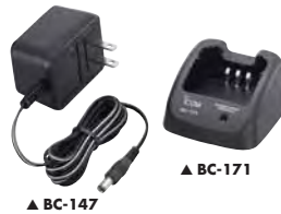
▲ BC-147 ▲ BC-171

BC-171 DESKTOP CHARGER + BC-147 AC ADAPTER Charges the BP-232N in 10 hours (approx.).