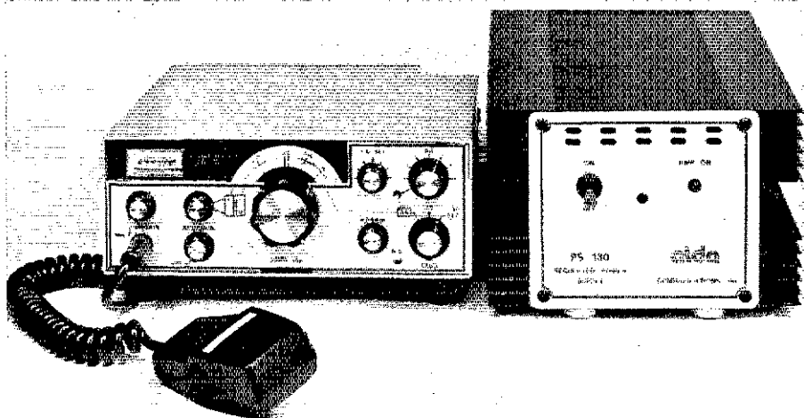
The Alda 103 and its optional 30-A supply, the PS-130. The dial on the '103 is available in Braille for the blind ham.

been quite effective in reducing ignition-pulse interference, and this writer's car has a particularly noisy ignition system! I'm fairly sure that the pulse noise could have been eliminated if some basic ignition shielding had been employed. However, an effective noise blanker makes one lax about taking care of this type of problem at its source. The optional calibrator has ample output; it is heard easily amongst the outside signals. The 10-kHz setting is particularly convenient. The "dial set," used in conjunction with the calibrator, rather than the usual mechanical type, is a variable capacitor in the VFO circuit. Reducing the rf gain was particularly effective in helping to separate strong stations from weaker ones, indicating some tendency toward strong-signal overloading. This was especially noticeable when the '103 was used with the audio gain "up full" under noisy mobile operating conditions.