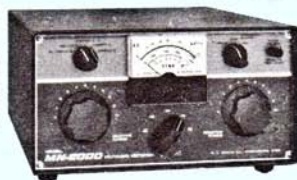
MN-2000 (Model No. 1509)

A Drake matching network is a worthwhile addition to any amateur station where peak performance is desired. Basically identical, except for power handling capabilities, the MN-4 and MN-2000 enable feedline SWR's of 5:1 to be matched to the transmitter. If input impedance is purely resistive, even higher SWR's can be handled. • Besides presenting a 50 ohm load to the transmitter, the Matching Network's built in rf wattmeter allows accurate and continuous power measurement and VSWR indication. The advanced wattmeter circuitry yields frequency-insensitive readings from 2 to 30 MHz, and accuracy until now obtainable only in expensive wattmeters.