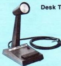
Desk Type Model No. 7075

Wired for use with Drake transmitters and transceivers, for either push-to-talk or VOX. Type of operation is determined by the VOX control setting of the transmitter.