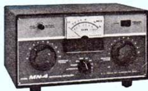
MN-4 (Model No. 1507)