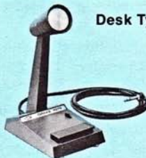
Desk Type Model No. 7075

Wired for use with Drake transmitters and transceivers, for either push-to-talk or VOX. Type of operation is determined by the VOX control setting of the transmitter.