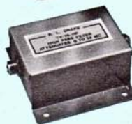
Model No. 1610