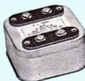
Model No. 1603

provide more than 40 dB attenuation at 52 MHz and lower. Protect the TV set from amateur transmitters 6-160 meters.