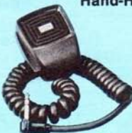
Hand-Held Type Model No. 7072

• Type: Heavy Duty Ceramic Desk Top • Cable: Four Foot, 3-Conductor, One Shield • Output Level: Minus 54 dB (0 dB = 1 volt/microbar) • Frequency Response: 80-7000 Hz • Switching: Adapts to either push-to-talk or VOX.