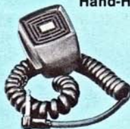
Hand-Held Type Model No. 7072

• Type: Heavy Duty Ceramic Desk Top • Cable: Four Foot, 3-Conductor, One Shield • Output Level: Minus 54 dB (0 dB = 1 volt/microbar) • Frequency Response: 80-7000 Hz • Switching: Adapts to either push-to-talk or VOX.