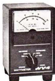
Model No. 1515