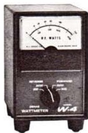
Model No. 1513