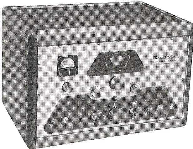
Original DX-100 from a 1956 Heathkit ad.

This past April the Heathkit DX-40 amateur transmitter was featured in this column. Also discussed were the DX-20, DX-35 and DX-60 family models. They all were either strictly CW or AM/CW using controlled-carrier modulation (low-level screen-grid modulation). Each larger numbered model ran a tad more power, with the DX-60 running 90 watts input on CW. These transmitters were very popular with novices and new hams between the fifties and mid-seventies.