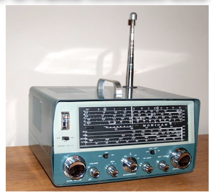
Fig 1: Beautifully Restored GC-1A Mohican.

I could not find a copy of the manual or even a schematic of the early GC-1. I did find a schematic of the GC-1U which is the European version of the GC-1.