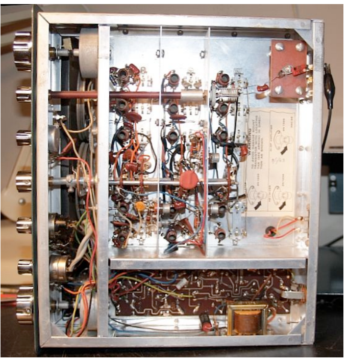
Fig 2: GC-1A Mohican under chassis view.

This article originally appeared in the October 2011 issue of RF, the newsletter of the Orange County Amateur Radio Club - W6ZE.