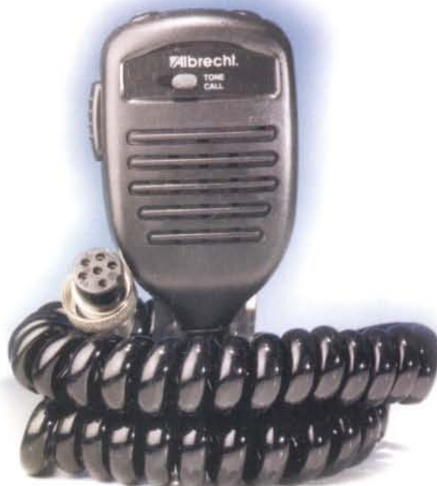
Fig. 2: The transceiver is supplied with an electret insert microphone rather than the more common moving coil type often found on CB radio equipment.

An excellent ‘starter’ rig in my opinion for budget mobile use (possible modification for 50MHz perhaps?).