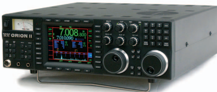
PHOTO 1. THE ORION II FRONT-ON, SHOWING THE CRISP NEW COLOUR DISPLAY