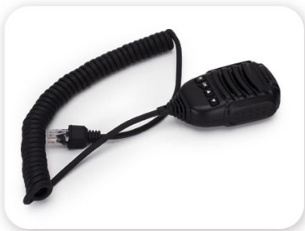
Wired Speaker Microphone