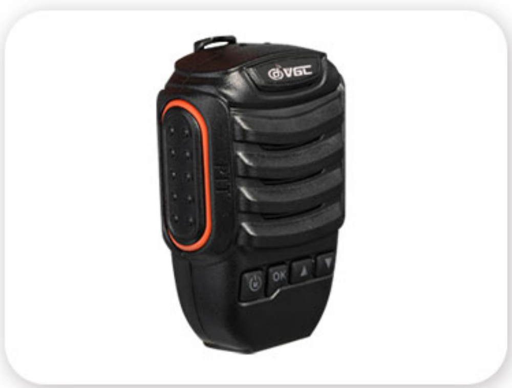
Bluetooth Speaker Microphone