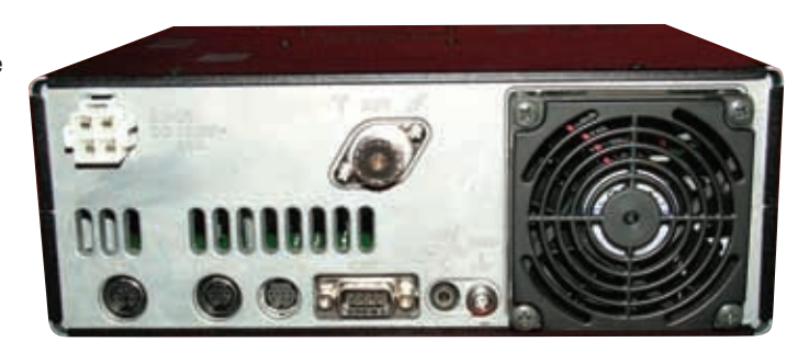
Fig. 4: The (relatively) simple rear panel.