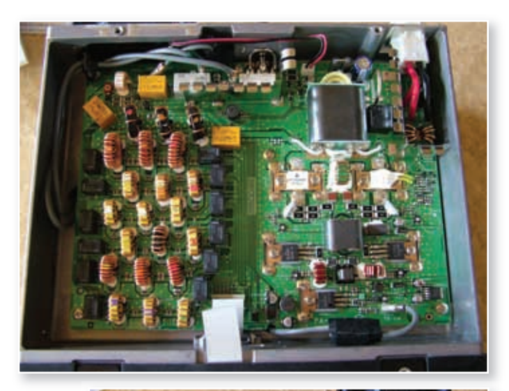
Figs. 2 and 3: Internal views of the FT-40 circuitry, includina power amplifier stage.

I think Yaesu have a winner here, with the few exceptions I have mentioned. It is well designed and thought out, well built and ideal as I have said for portable use, holiday locations and mobile. The price at £639.99 (£739.99 with a.a.t.u.) is not bad either! My thanks to Yaesu for the loan of the transceiver for review.