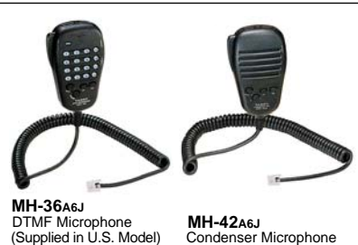
(Supplied in U.S. Model)